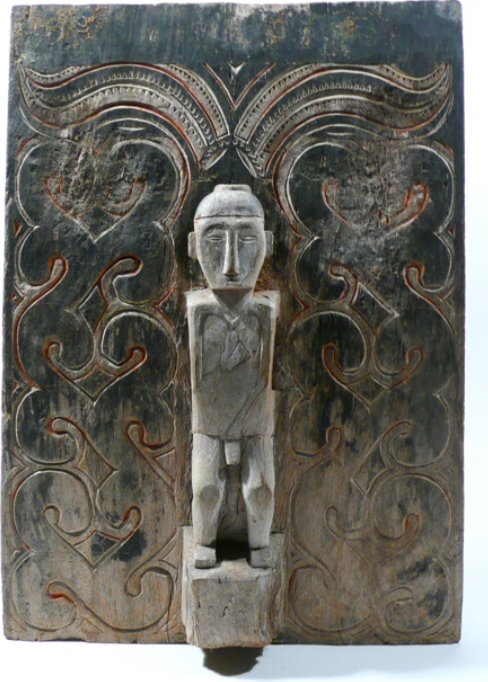
Rare Shrine Door. Toraja, Sulawesi Island.