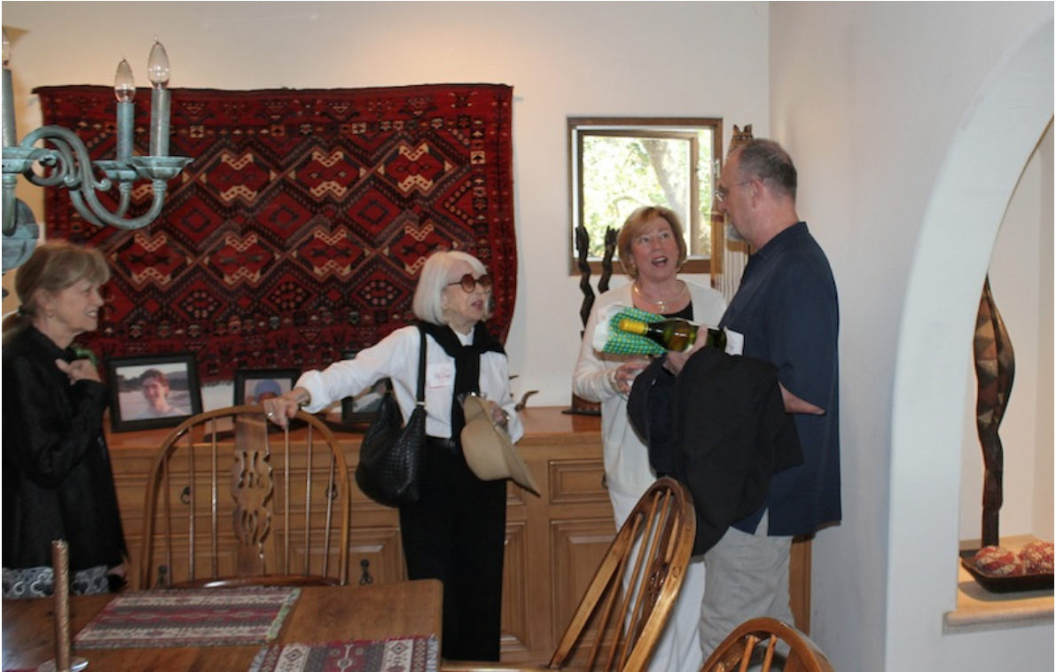
EAC members enjoy Ruderman art collection